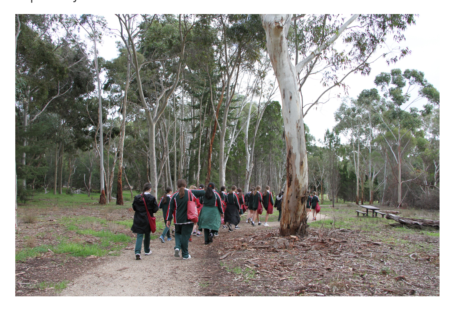
Year 7 Outdoor Education students completed a nature walk at Hope Valley Reservoir. It is amazing that we have such a quiet, peaceful setting so close to the city - and students saw kangaroos and a joey, as well as all of the birdlife on the Reservoir.