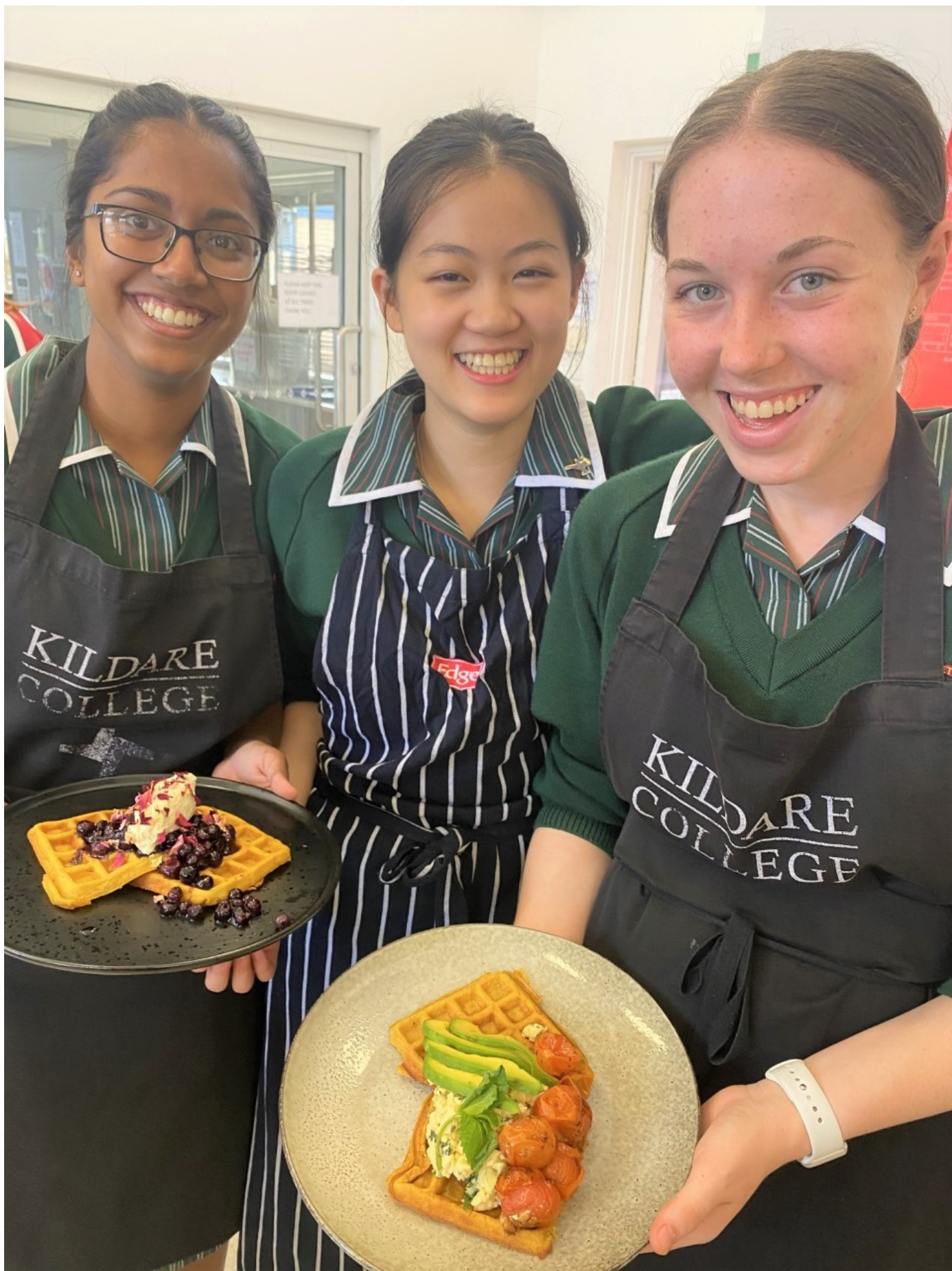
Our first Baking Club for 2021 was a hit! Students made mini strawberry and mint cheesecakes and pumpkin waffles.